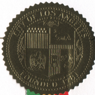
NATE HOLDEN Councilmember 10th District